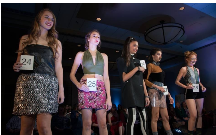
2016 Project Funway See more designs from the runway on the Fresh Start Facebook page!

Save the Date for Project Funway Friday October 13, 2017! Visit our website for more details, information on being a designer or becoming a sponsor!