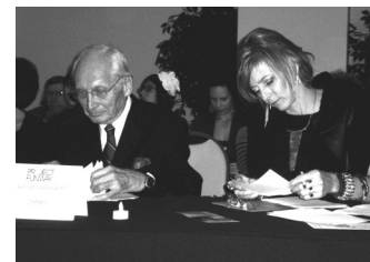
Judges make notes during runway show