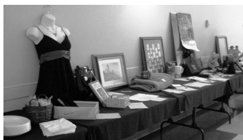
Items on the Silent Auction