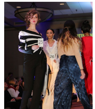
Events like mini golf and Project Funway raised awareness and funds.