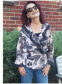
April is all smiles

Before arriving at Fresh Start, I went through the 8 week addiction treatment program at St. Monica's. I had been struggling with alcohol addiction for the past 6 years. In July 2018 I finally hit Rock Bottom. I lost everything I owned over the past 49 years. I was homeless and slept under trees; I dug in restaurant and park dumpsters for food. I'm a woman that once had a career and made $50,000 a year.